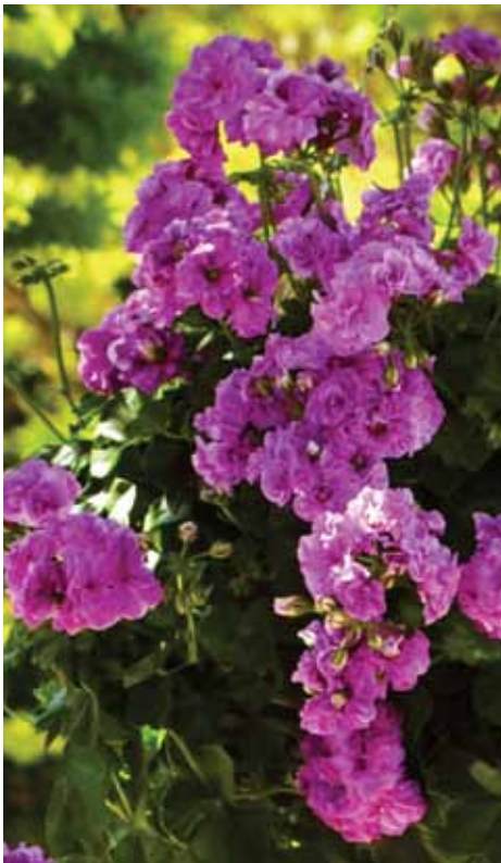
Ivy Geranium Hanging Basket Full Sun