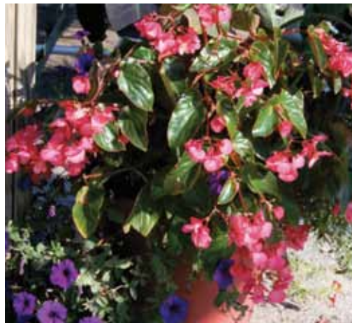
Euro-Planter Part Shade to Full Sun