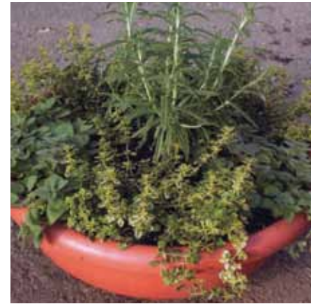
Herb Planter Full Sun