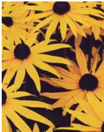
Black Eyed Susan Full Sun - 18" Tall