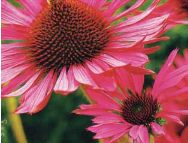
Purple Coneflower Full Sun - 24" Tall