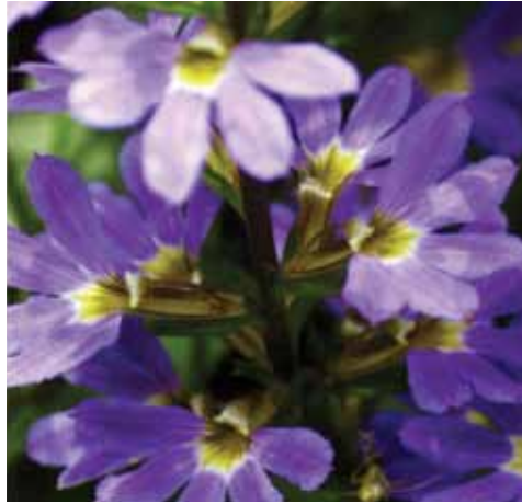
Scaevola (Full Sun)