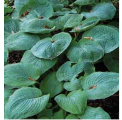
Big Blue Hosta Full Shade - 24" Tall