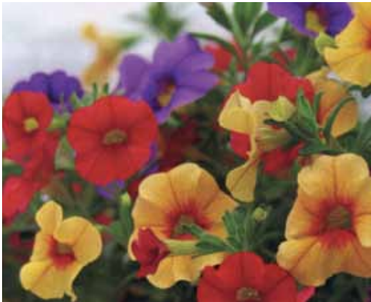
Mixed Million Bells Hanging Basket Part to Full Sun