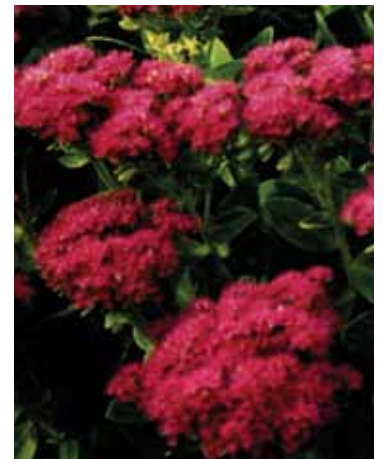
Autumn Joy Sedum Full Sun - 18" Tall