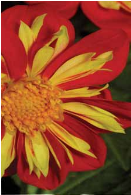
Dahlia (Full Sun)