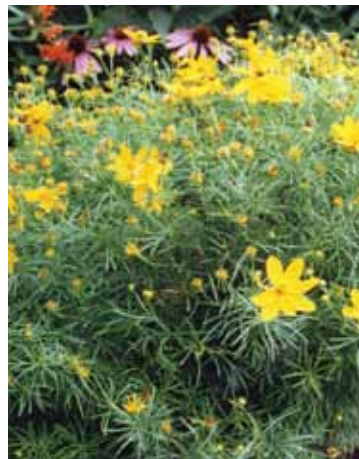
Zagreb Coreopsis Full Sun - 18" Tall