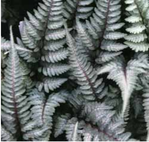
Japanese Painted Fern Full Sun - 12" Tall