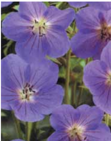
Brookside Geranium Part to Full Sun - 15" Tall