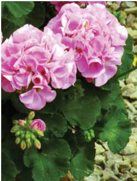
Geraniums (Full Sun)