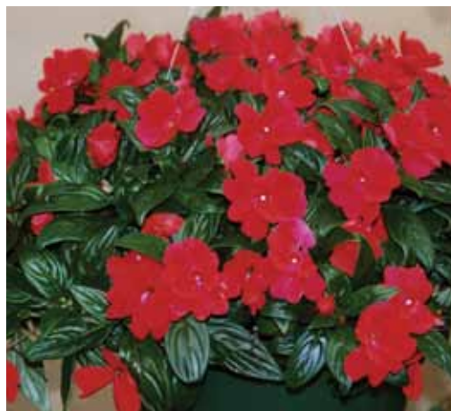
New Guinea Sun Impatiens Part Shade