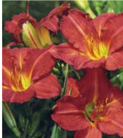
Red Magic Daylily Full Sun - 20" Tall