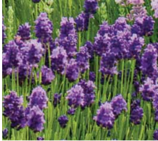
Lavender Full Sun - 12" Tall