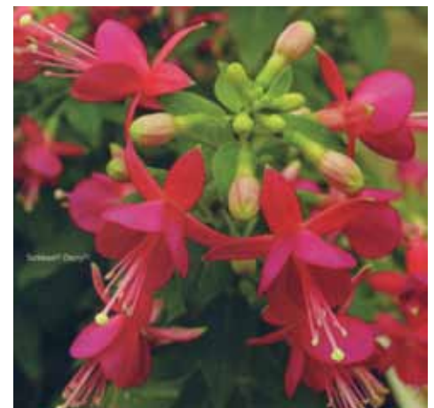
Fuchsia Hanging Basket Part Shade to Shade