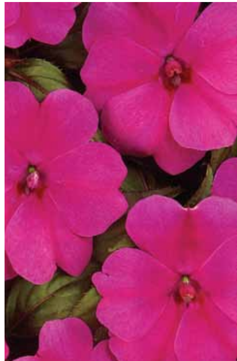
New Guinea Impatiens (Part Sun)