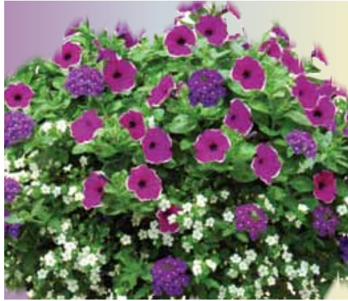
Mixed Hanging Basket Part to Full Sun