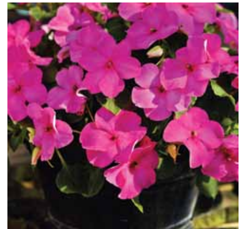
Shade Impatiens Part Shade to Shade