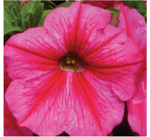
Wave Petunias (Full Sun)